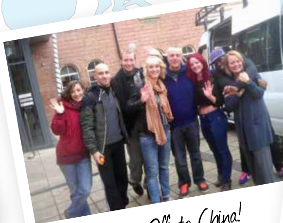
Off to China!