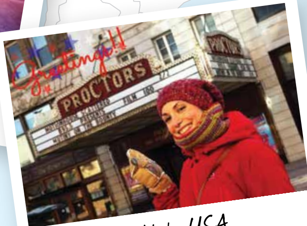
New York, USA

"Motionhouse dancers mesmerize with Scattered"