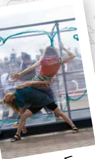
Angers - France