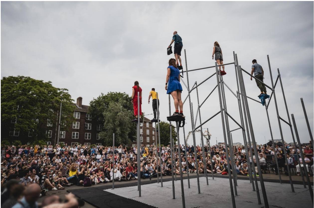
WILD at Greenwich + Docklands International Festival.