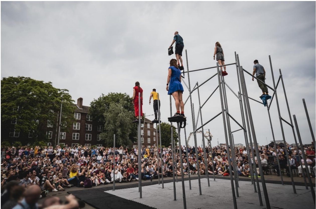
WILD at Greenwich + Docklands International Festival.

For more information or to book WILD, contact: Amy Belfield on amy@motionhouse.co.uk