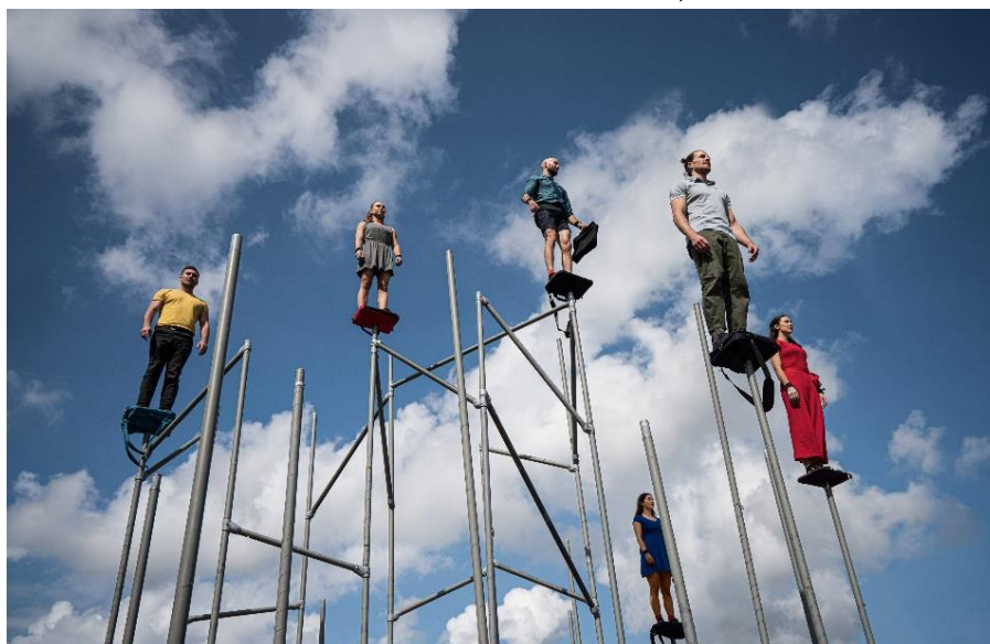
Above left, Charge and here WILD

Motionhouse, Spencer Yard, Leamington Spa, Warwickshire, CV31 3SY, UK +44(0)1926 887 052 info@motionhouse.co.uk www.motionhouse.co.uk