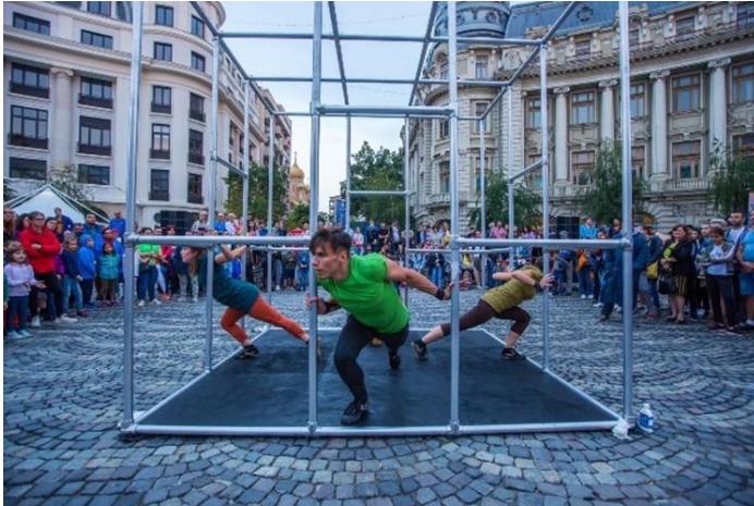
Audiences enjoy Captive at B-FIT in the Street Festival, Bucharest, Romania.

Examples of our dynamic and powerful outdoor and theatre productions