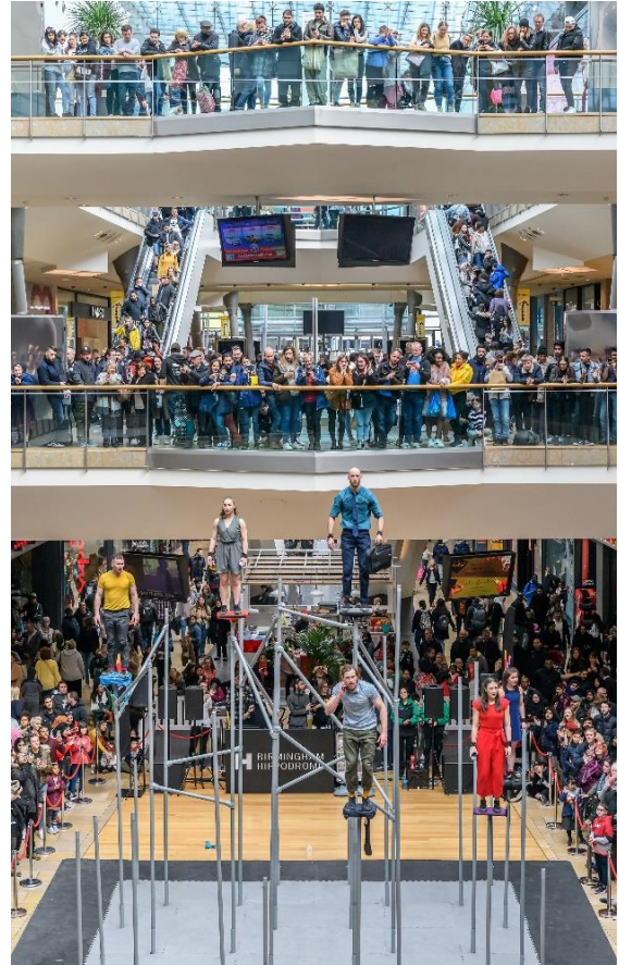
WILD attracts large crowds of shoppers in the Bullring, Birmingham.