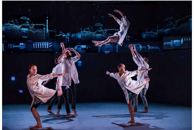
Our theatre productions Broken and Charge