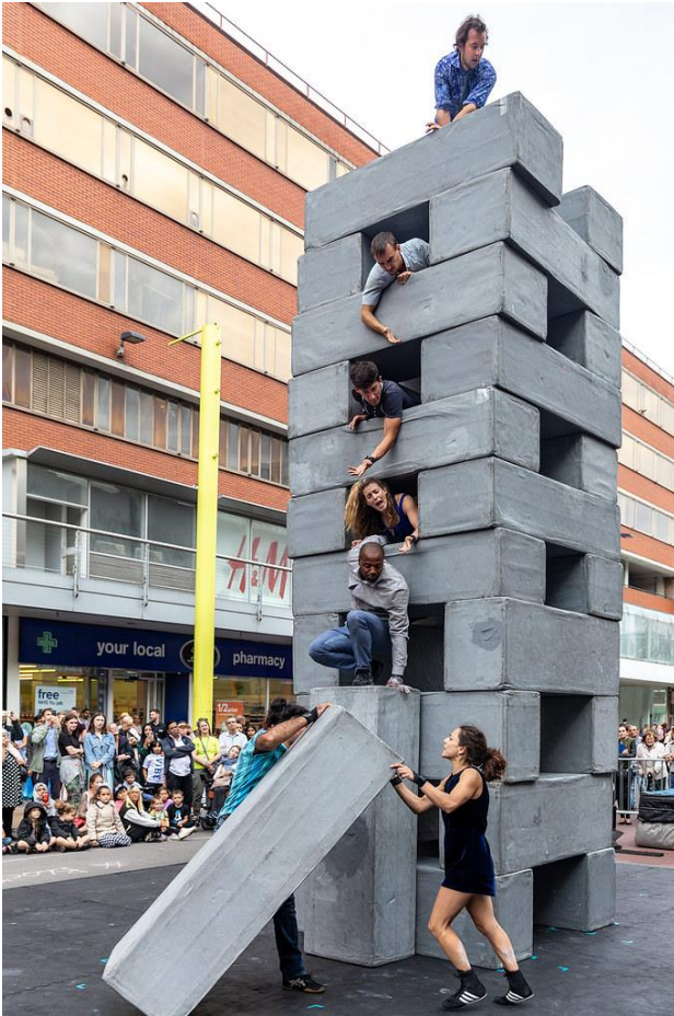
Our collaboration, BLOCK, with NoFit State Circus