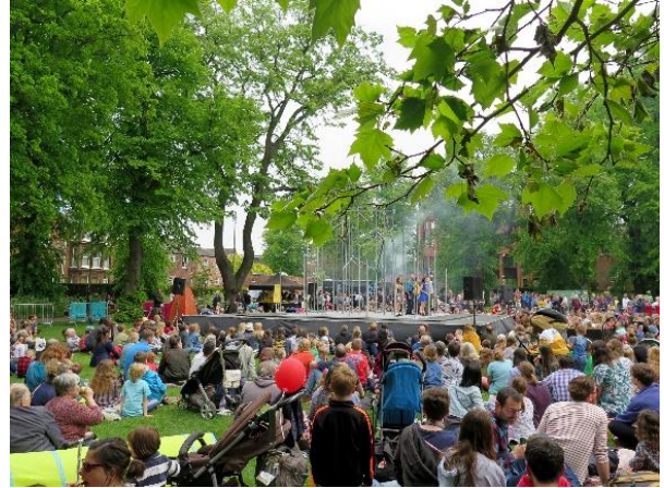
WILD in Nottingham, UK.

Our full technical rider provides detail on all considerations.