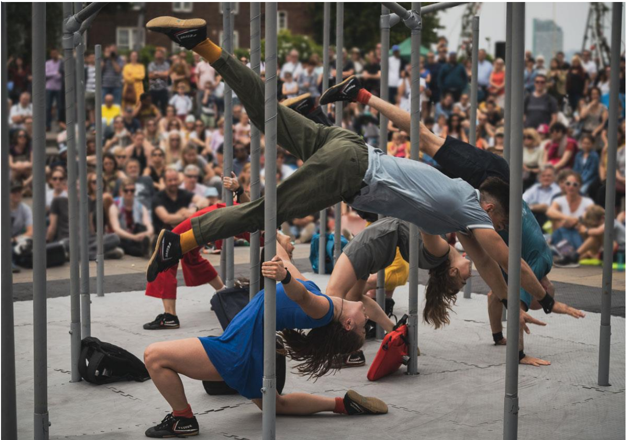
WILD at Greenwich + Docklands International Festival.