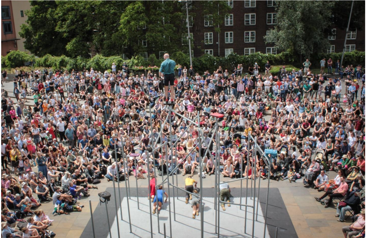
WILD at Greenwich + Docklands International Festival.