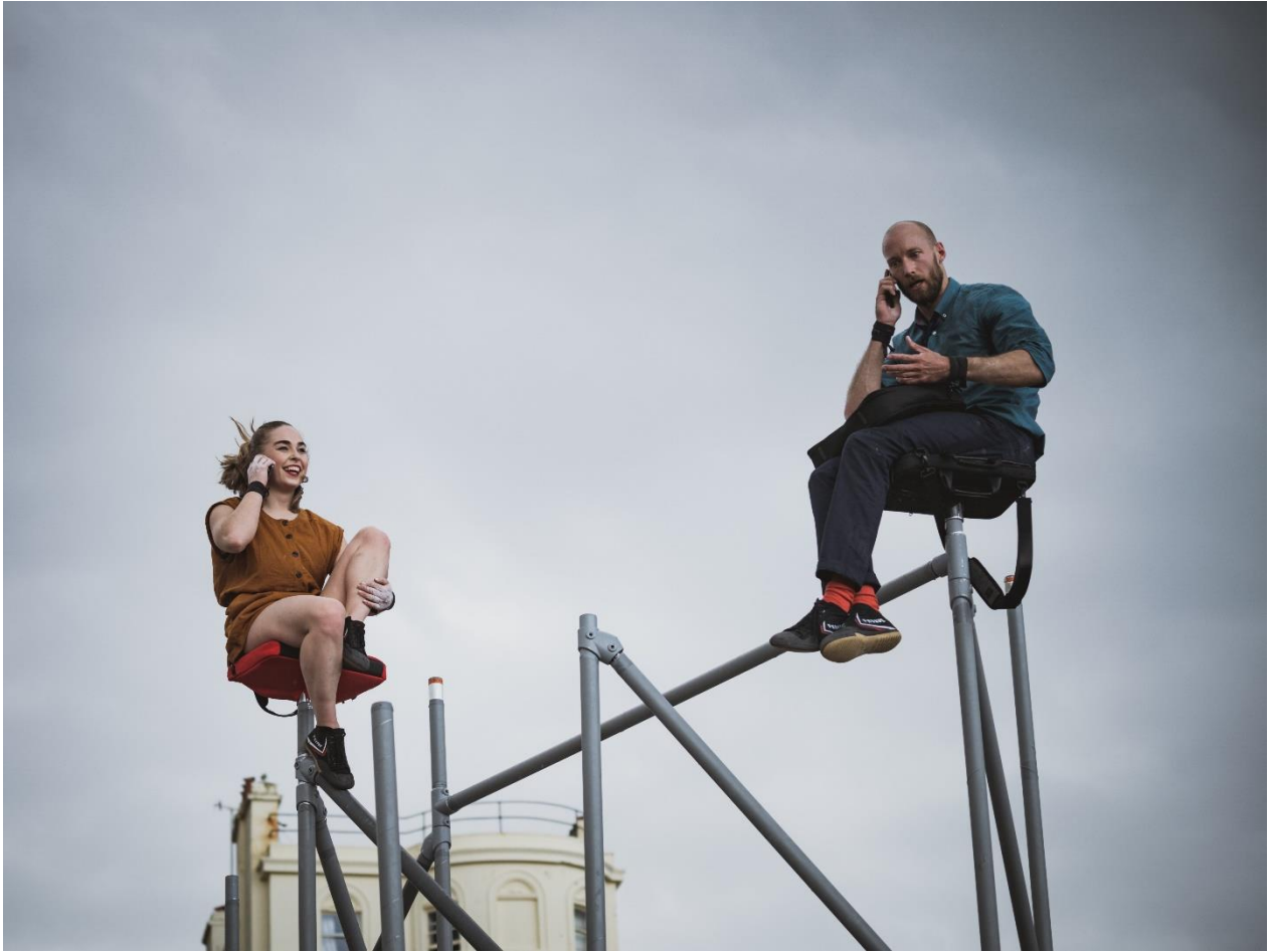
WILD at Brighton Festival.