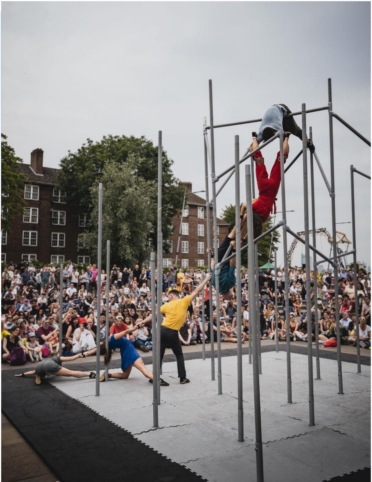
WILD at Greenwich + Docklands International Festival.